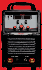
A) Discover 300 power source