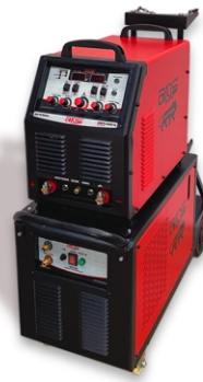
B) Genesis 400HDTig power source with Cooling Unit Trolley