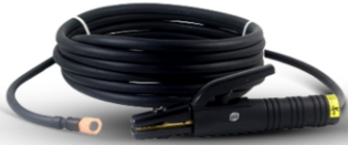
1) Electrode Holder 400A with 3 meter 50sqmm cable