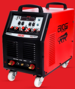
A) Genesis 400HDTig power source with wheels