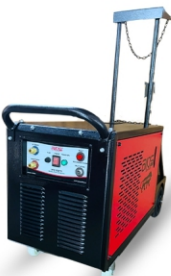
10) TIG Torch Cooling unit WC50 - with Cast Iron Pump