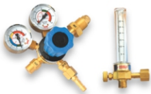
8) Argon Regulator Single Stage Double guage

Order Code: AGC3004M (4mtr) / AGC3008M (8mtr)