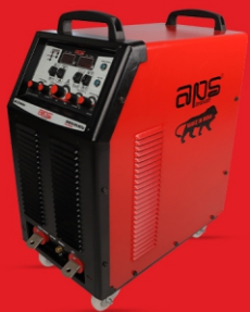
A) Genesis 600HDTig power source with wheels