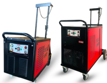
9) TIG Torch Cooling unit WC100FS (Stainless steel Pump, Inbuilt Flow-switch with indication and Fault output for TIG torch protection) 100 Litre Tank.